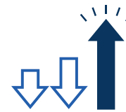
Financial independence review or retirement income analysis