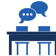
Coordinating with multiple advisors [i.e. CPA, attorney, etc]