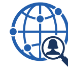
Estate and/or charitable planning