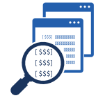
Analysis of tax returns & working to reduce tax liability