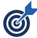
Goal identification & clarification